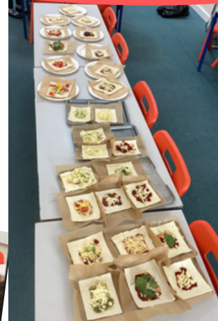
Willow Class made vegetable and cheese tarts. Many of the children summoned their up courage to try a range of vegetables they don't normally eat or like. They gave the finished product a big Thumbs Up!