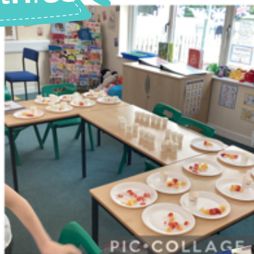
Cherry Class prepared and tasted different types of fruit before blending them into smoothies.