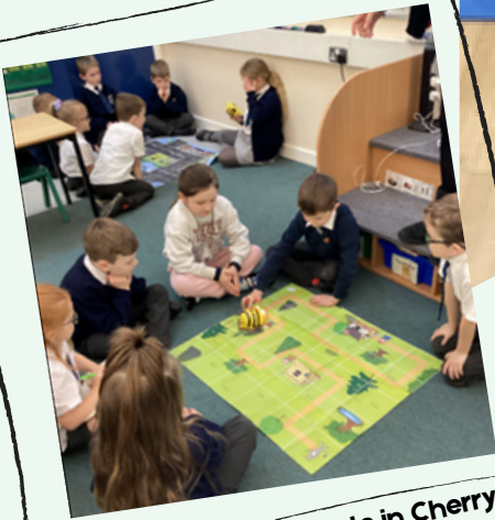
Programming Beebots in Cherry Class ICT lessons