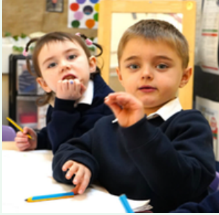
Deep in thought...

Thank you to the PTFA for a fabulous disco!