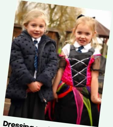
Dressing up to ward off the winter chill!