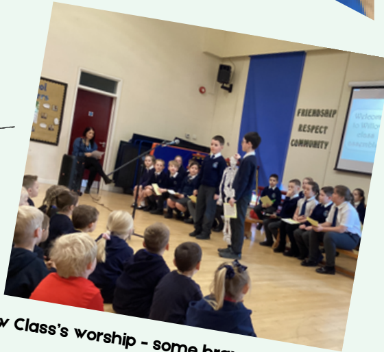
Willow Class's worship - some brave performances.