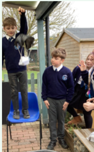
Parachute testing in Oak Class