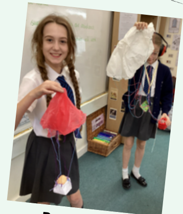
Ready to fly