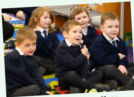
Story-time in Cherry Class